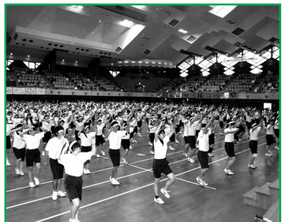
All of the students warming up for the event

day in New Zealand, but that just made it a more exciting and new experience. I partook in the three-legged race and Tamaire, a Japanese game where everyone throws balls into a basket on a tall pole. I was a little scared for the three-legged race because everyone was so fast, but it ended up being really fun. I could see that Mejiro Kenshin students have great teamwork!